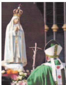
Pope Francis consecrates

Pope Francis' Prayer for the Families of the World October 28, 2013